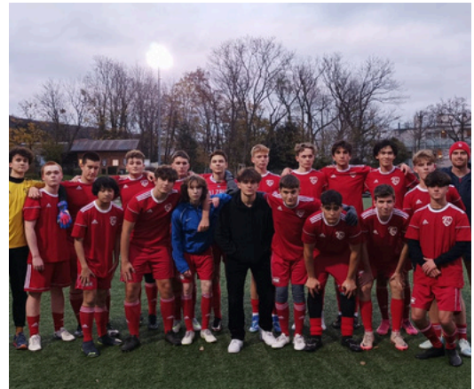
Football team from Fall 2024