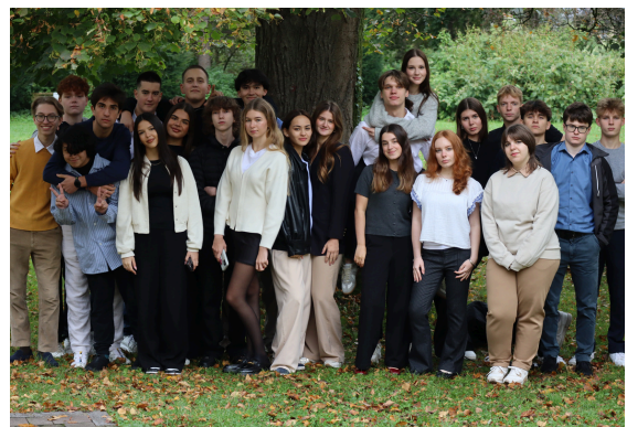
Class of 2025