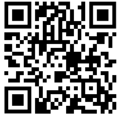
Scan this QR code to see every compliment on the school’s instagram.

Just by going into a form and giving a response, you can help people get back on their feet and have a good day. Students don’t think about how an action like a compliment can really help and change someone. I hope this can mend the issues we have in school and therefore make it a better place for students and faculty alike.