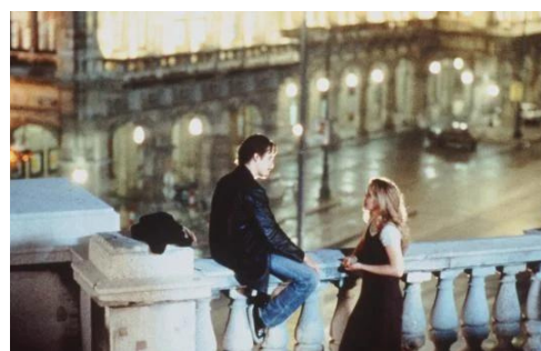
Scene from movie "Before Sunrise"

"Frances Ha" is a delightful film that follows the quirky and endearing Francesca as she navigates the challenges of life and friendship in New York City. Shot in black and white, the movie captures the essence of her journey with a charming simplicity. This is a film about how people accidentally collide and also accidentally diverge. The movie shows us how with each person who passes through our lives, we learn to find stability and love in ourselves and not in others.