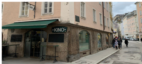
Mozartkino in Salzburg's Altstadt is a convenient cinema to visit and often offers movies in English

Are you missing ideas for making this day more special and also don't want to spend a lot of money or energy? A cozy movie evening is always the key for a memorable holiday. Even if you don't assign a lot of meaning to Valentine's Day, this list of sincere movies will help you make your evening relaxing and peaceful.