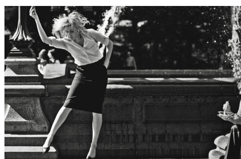
Frances in the movie "Frances Ha"

Remember that love surrounds you everywhere even if you don't notice it. When you think about your family, when you call a close friend or when you smile at a cute pet in the city, your heart is full of love. Hopefully one of these movies will remind you of it. And we wish you a Happy Valentine's Day!