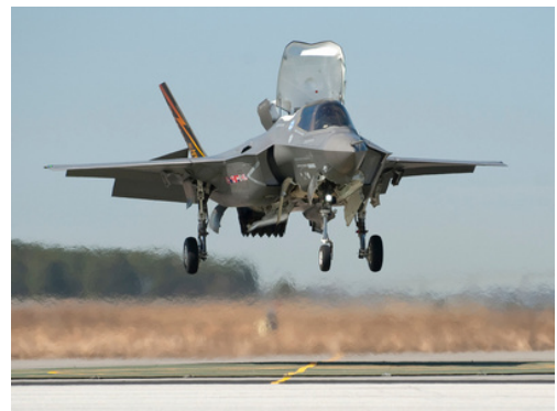
An F35B-Lightning II making it's first decent

There are many aircraft in many variants, including: military, commercial, and private. Something that almost everyone has seen is a normal commercial airliner, such as the Boeing 737. With more than 11,000 aircraft in circulation right now, the Boeing 737 is one of the most popular aircraft used today. These aircraft go through extensive testing to ensure safe use. For example, Boeing ensures their seats are held at 648°C for 2 minutes to withstand charring and evacuation of the whole plane is possible in 90 seconds.