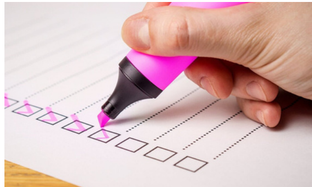
Managing your time by creating a checklist