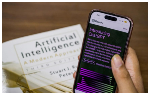
The main page of ChatGPT website