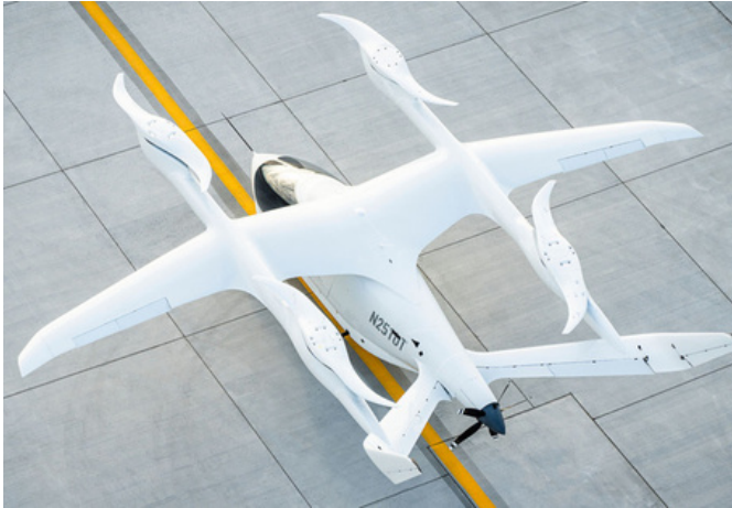
The BETA Technologies ALIA

Flying in a plane is one of the safest forms of transportation, with only 1/11 Million planes going down. That's one plane every 49 years, as, according to Flightradar24, a Swedish air traffic tracking website, there are about 223,485 planes – including military and cargo planes – that take off per year! Some very interesting planes include the Cirrus Vision Jet, a private aircraft with a built in parachute, the F35B-Lightning II (seen on page 2), known for its vertical take off (VTOL) capabilities, the SR-71 Blackbird, the fastest air breathing aircraft at mach 3 (3.540 km/h), or the BETA Technologies Alia, a fully electric propeller-powered aircraft, seen to the left.